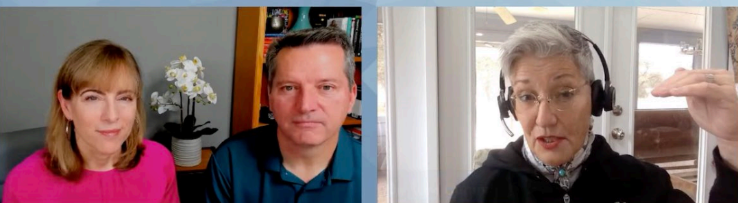
Untangling Alzheimer's & Other Dementias