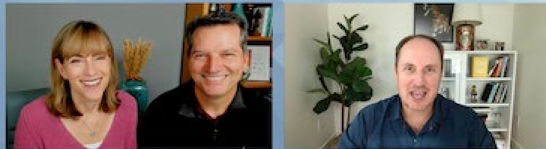
Finding the Right Place at the Right Time