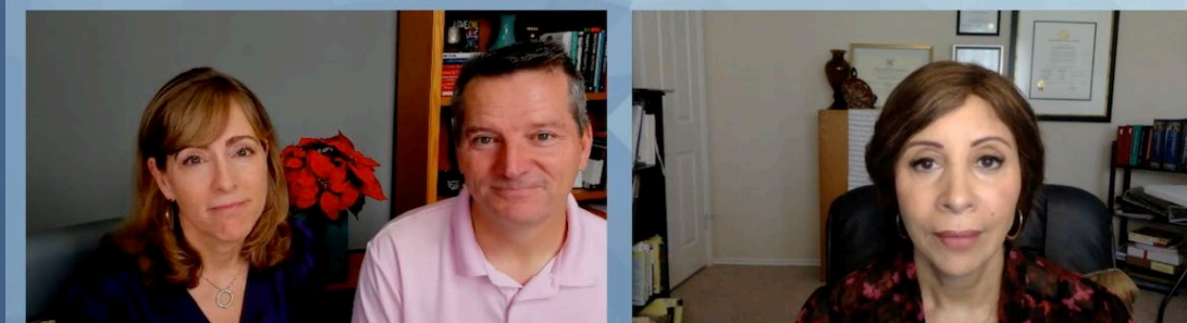
Scams on seniors