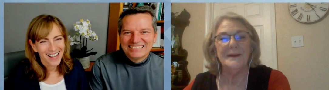
Navigating Social Security