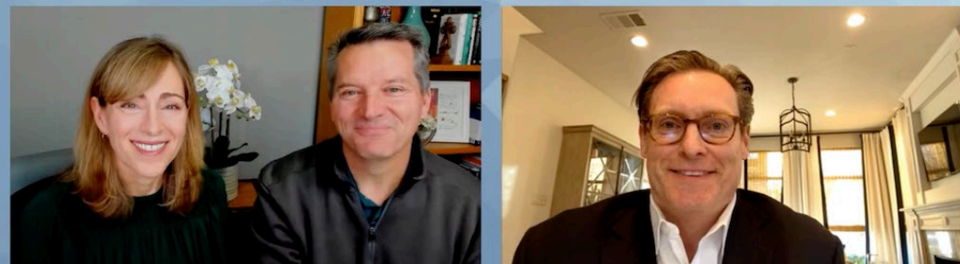
Financial options: Reverse Mortgages